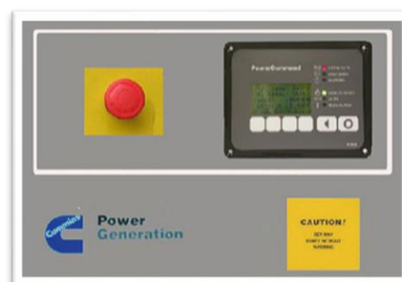
PCC 1301 Control