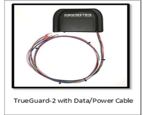
TrueGuard-2 with Data/Power Cable