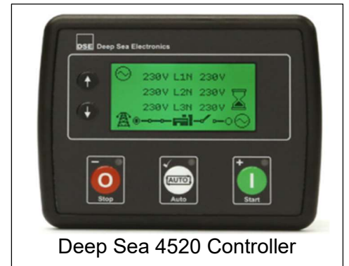
Deep Sea 4520 Controller